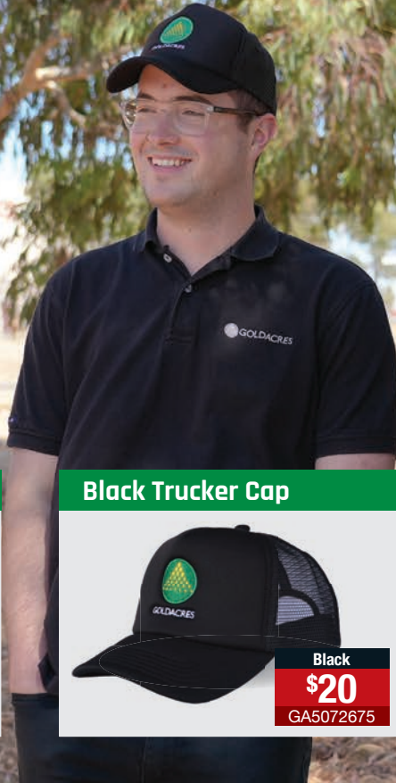
Black Trucker Cap