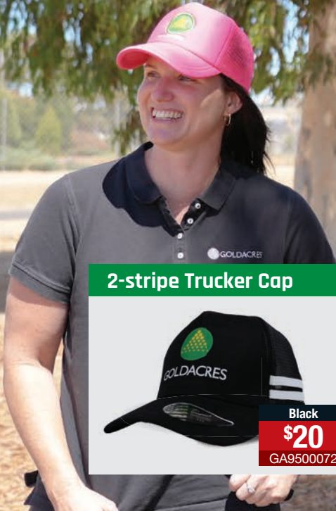
2-stripe Trucker Cap