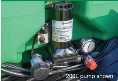
200L pump shown